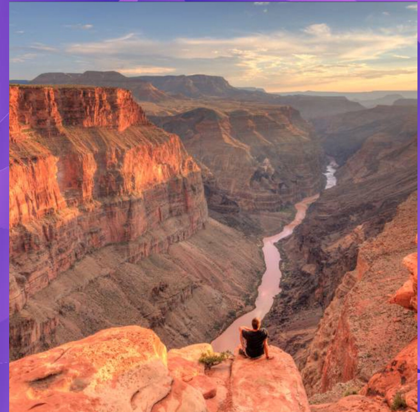
Grand canyon in arizona