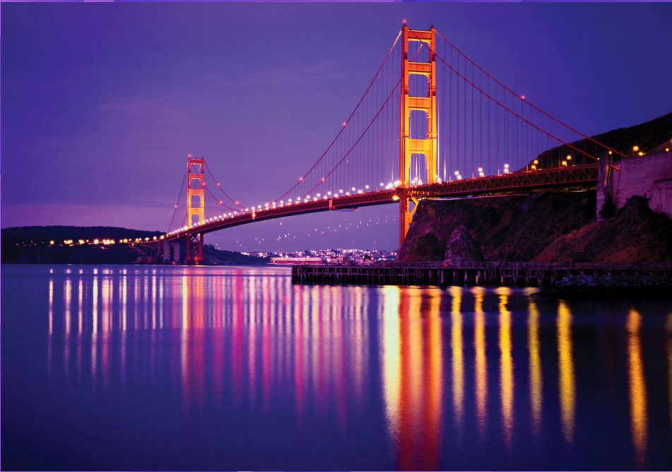
Golden gate bridge in san francisco