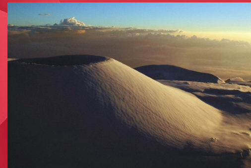
coast state wilderness park